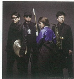
Near East Quartet