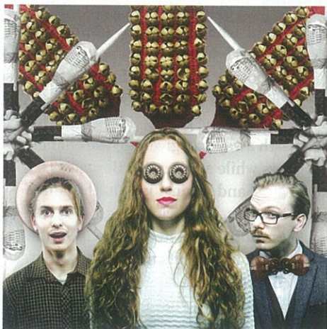
Nina and The Butterfly Fish