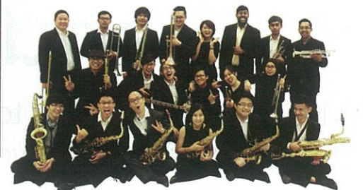
Penang Philharmonic Big Band