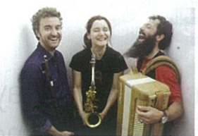
Angelika Niescier NOW